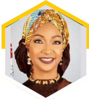
Barr. Hannatu Musa Musawa FITPN Honourable Minister Federal Ministry of Arts, Culture, Tourism, and Creative Economy