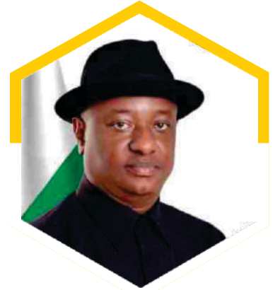
Honourable Festus Keyamo Minister of Aviation and Aerospace Development