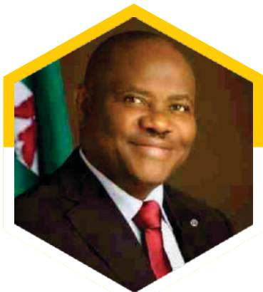
Honourable Ezenwo Nyesom Wike Honourable Minister, Federal Capital Territory Host City Minister