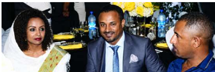
Awards & Gala Night 28th July, 2026