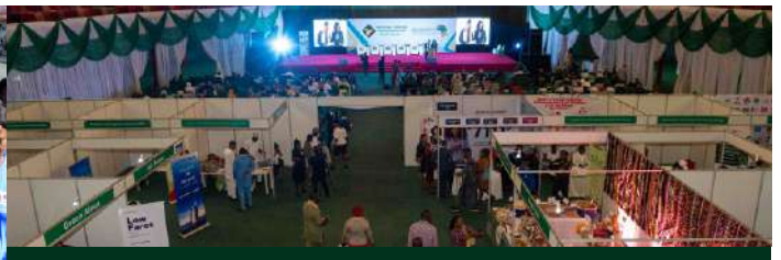
Tourism Transport Summit / Exhibition / B2B and G2B Sessions / Career Fair. 27th - 28th July, 2026