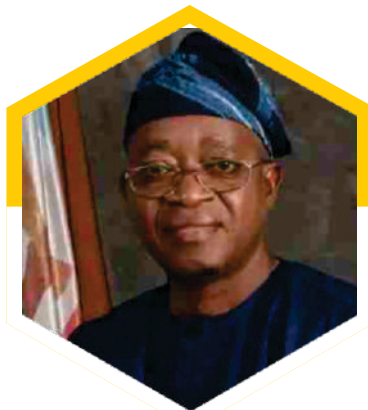
Honourable Gboyega Oyetola Minister of Marine & Blue Economy