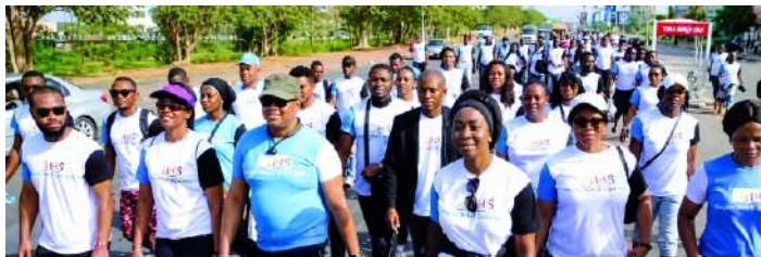
Abuja City Walk 25th July, 2026

Over 1,200 delegates, speakers, exhibitors and general participants are expected to attend the 9th edition of National Tourism Transportation Summit & Exhibition in Abuja, Nigeria.