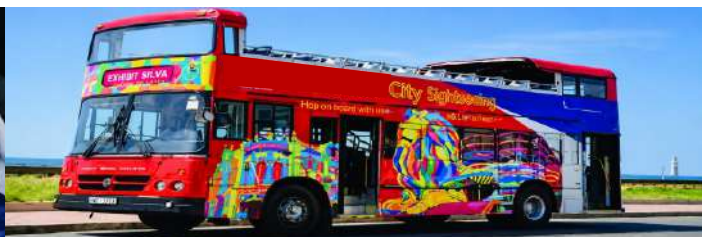
Abuja City Tour 29th July, 2026