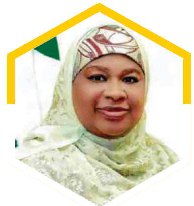
Honourable Dr. Mariya Mahmoud Minister of state FCT