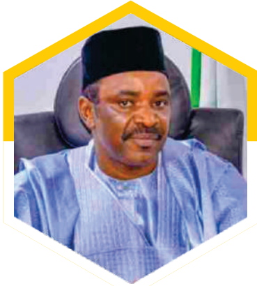
Honourable Sa'idu Alkali Minister of Transportation